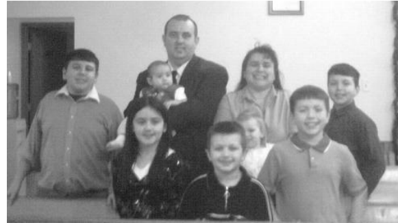
"7" IS THEIR LUCKY NUMBER.